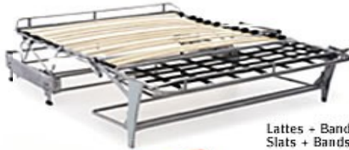
Lattes + Bandes Slats + Bands

Prévoir liaison dos-manchette A link between the back and the armrest should be used